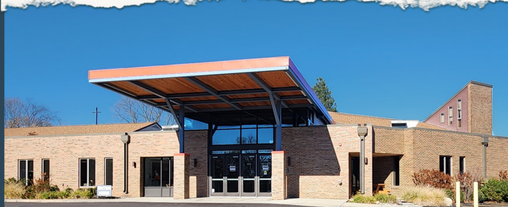
Faith Covenant Church - Farmington Hills, MI

Any member of a GLC church is welcome to attend the celebration. Only church elected delegates may vote at the Saturday business meeting. The workshops, banquet, worship service, and the business meeting are open to all.