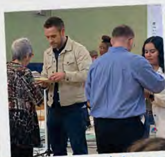
Communion at Mosaic Church - Grand Rapids

Credentialing: We guided, coached, and coordinated licensing interviews for 15 pastors who either began their credentialing process or hit a significant milestone in that process. We monitored/assisted 37 additional pastors in the GLC who have renewable credentials with the ECC. Care: The cumulative toll on pastors and leaders caused by the lingering impacts of the COVID pandemic, racial tension, and political polarization continue throughout 2022. To care well for our pastors, GLC staff members prayed regularly for our pastors, contacted pastors individually to check in, urged participation in monthly "cluster" gatherings with peers for prayer, the sharing of best practices, and for mutual encouragement. Staff made it possible for pastors to visit one of our camps for 3-day/2-night getaways at no cost. Multiple pastors received mental health therapy to deal with acute challenges, and partnered with the GLC Ministerial Association officers to provide scholarships so that any pastor who wanted to attend our Pastors Fall Retreat could do so.