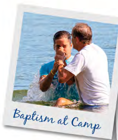
Baptism at Camp

Conflict: Addressing conflict in healthy ways was the subject of numerous informal coaching conversations with both pastors and lay leaders in local churches. Racial Righteousness: We encouraged our churches to take steps toward reflecting the demographics of their community, to address racism in their communities, and to pursue ministries of compassion, mercy and justice. Leadership Support: We coached 36 churches in best practices to improve financial accounting and reporting systems, develop fair compensation packages for pastoral staff, or review their staffing structure. We provided a webinar to help church leaders strengthen their financial management practices. We consulted with two churches in matters of possible property transactions. We coached 15 churches/pastors in the various stages of pastoral transition: preparing for a transition, concluding a ministry, finding an interim pastor, conducting a search process, and installing a new pastor. Theological Education: We engaged with North Park Seminary staff to continue to provide access to theological education at reduced costs for GLC church staff members.