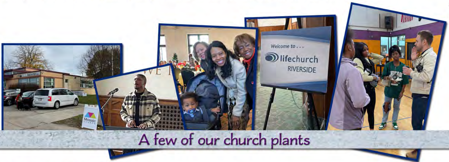
A few of our church plants

Thanks to a generous matching grant (provided in 2019) to plant four churches and thanks to proceeds from the sale of the Redeemer Covenant Church building in Caledonia, MI in 2021 (70% of which can be used for new church plants) the GLC has had the resources to start new churches in recent years. In 2022, we started Mosaic Covenant Church in Grand Rapids, MI; The Freedom Room in Detroit, MI; and Life Transformation Church in Columbus, OH. An additional grant made it possible for us to employ Phil Carr to coach current and prospective church planters. Meanwhile, Alan Tumpkin continued to serve the GLC on a half-time basis to guide the work of church planting, recruit prospective church planters, and provide technical coaching and pastoral care to church planters.