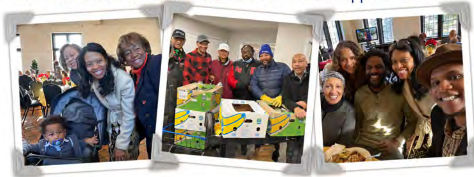
LifeChurch Riverside Detroit, MI

I am super grateful for the volunteers! LCR (LifeChurch Riverside) folk have done a great job of staffing the teams, showing up for service with a smile on their faces, helping any who have a need and they have given from the heart. I am always reminded that it takes a team of committed people to be the church of Jesus Christ. We had a combination church anniversary-volunteer appreciation brunch on the first Sunday in December of 2022. I really enjoyed the laughter, the friendship and the opportunity to thank all those whose contributions have made LifeChurch Riverside happen.