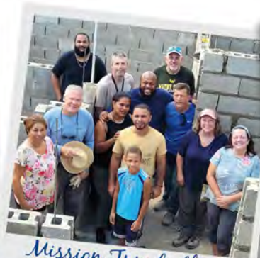
Mission Trip to the Dominican Republic