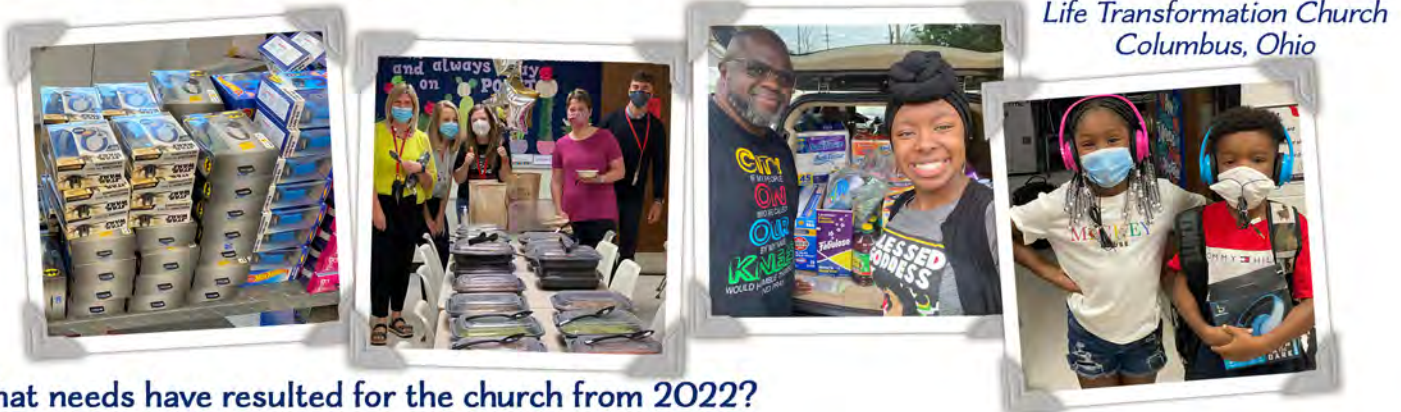
Life Transformation Church Columbus, Ohio

We are grateful that we were able to start two discipleship groups coming off of our year of discipleship training. We are super grateful for the people who have been faithful from day one, especially in light of the fact that we started our church development in the midst of the pandemic. We are grateful for the indicators that we may have the opportunity to move into the city of Columbus from the suburbs soon. And we are grateful for the opportunity to establish new Kingdom partners.