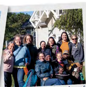
Hope Community Church at Women's retreat