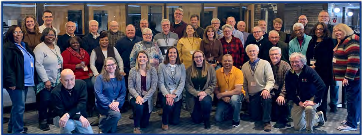
GLC's Church Chair Event

1 I waited patiently for the Lord to help me, and he turned and heard my cry. 2 He lifted me out of the pit of despair, out of the mud and the mire. He set my feet on solid ground and steadied me as I walked along. (New Living Translation)