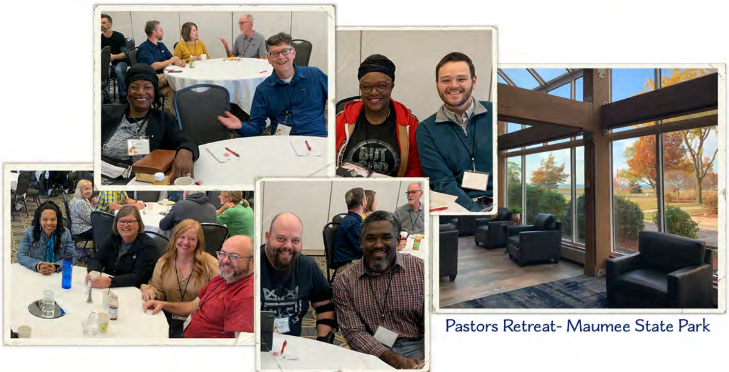
Pastors Retreat- Maumee State Park