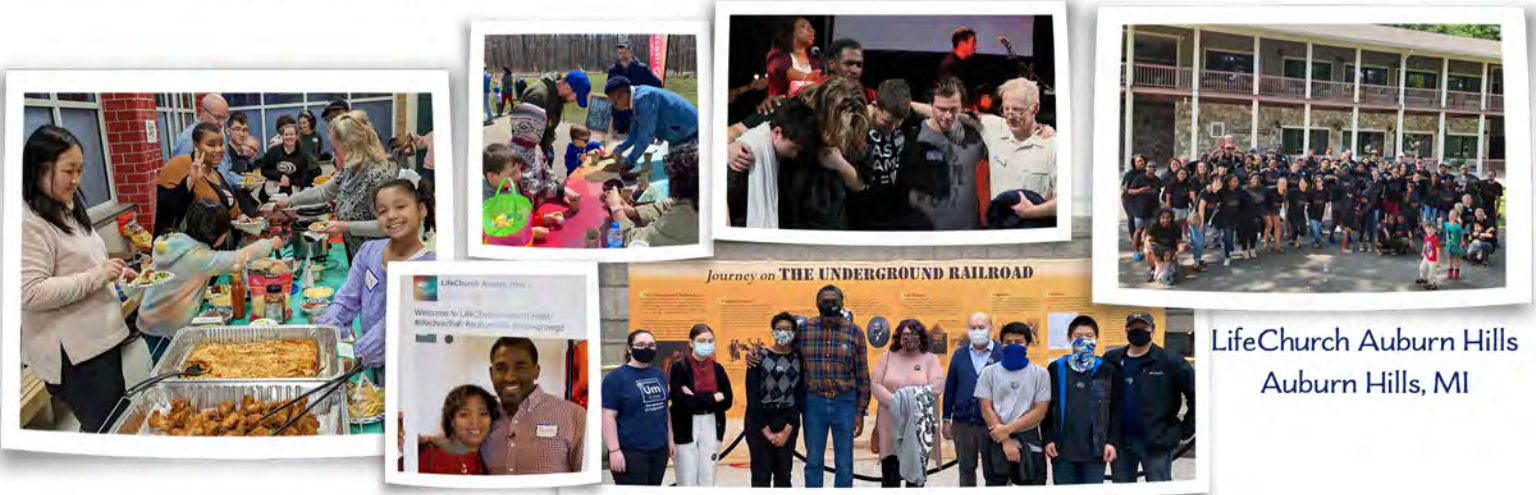
LifeChurch Auburn Hills Auburn Hills, MI

Our biggest challenge in 2022 was regaining traction from the cascading effects of launching a multiethnic church plant in 2019, the disruption of the pandemic, racial and political tension in 2020, getting our team, volunteers, and members back into the rhythm of in-person gathering in 2021 and fully transitioning back to in-person. Also, we had to move from our elementary school where we launched and had all of our previous gatherings and outreach, and find a new location because the school district could no longer accommodate us due to their custodial workers being overworked and understaffed post-pandemic. Additionally, we had to make cuts on an already bare-bones budget that impacted staffing and somewhat limited our outreach activity.