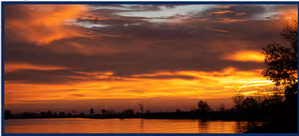
Sunrise at the Pastors Retreat