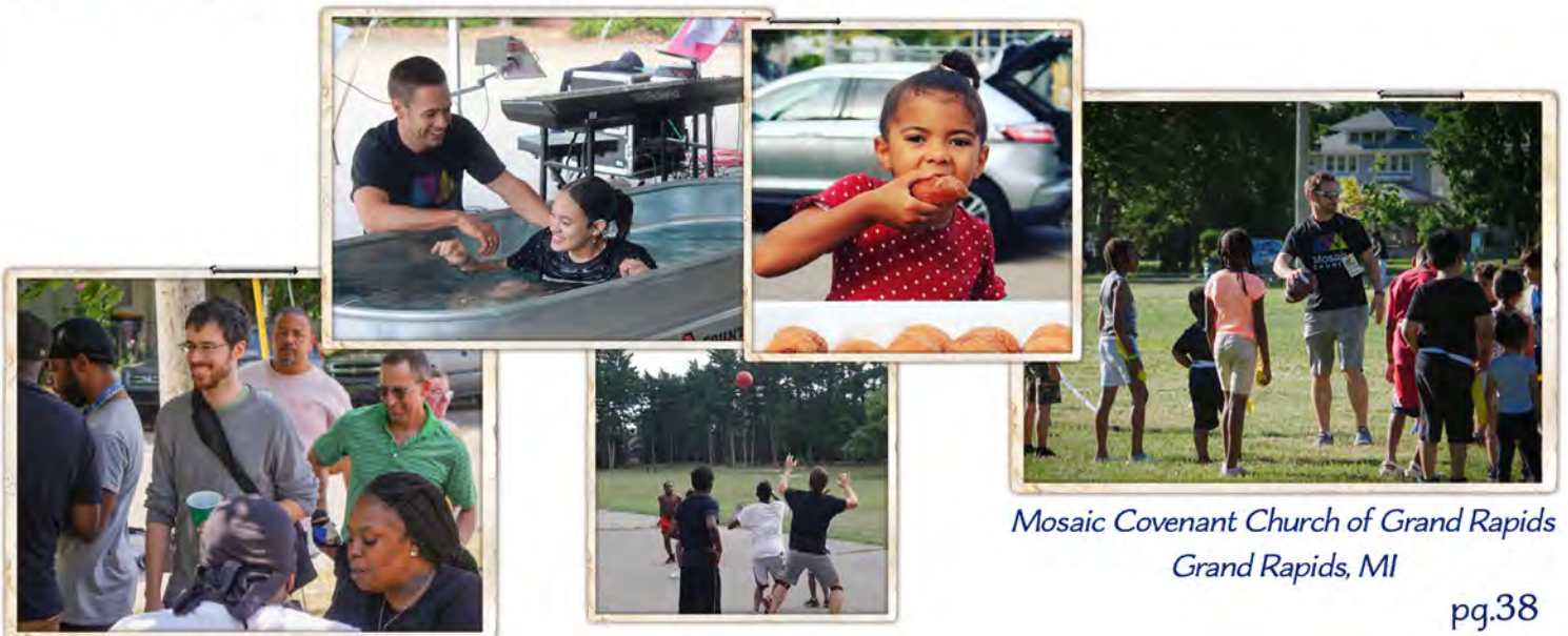
Mosaic Covenant Church of Grand Rapids Grand Rapids, MI

I'd love to see us grow in our discipleship. I'd love to see our new small groups be places where people dig deep into relationship with God and with each other. I'm thankful for our four small groups as they provide a space outside of Sunday morning for ministry to happen. We also have a goal of growing our Sunday attendance further, connecting more with the neighborhood, and seeing our brand new youth ministry grow both deep and wide. Another goal with our youth ministry, is to provide a church and discipleship bridge for all the teens we've done outreach with from the Boys & Girls Club, Summer Lights, and Grand Rapids F.I.R.E. track team small groups that we lead in the summer.