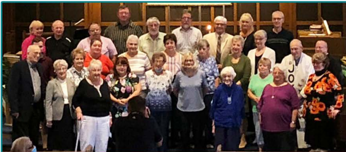
Members of Faith Covenant joining First Covenant as a unified group.

For the first year, the councils acted together with a representative from each congregation on each commission, allowing for trust to be built and in time, the councils were combined. The new members are no longer guests, but full participants and leaders. First Covenant is now thriving and has been energized with new, but experienced leadership. The best news is that now anyone new entering First Covenant Church of Youngstown has no idea that there were ever two churches or congregations. It is now ONE church welcoming all who seek Jesus and community.