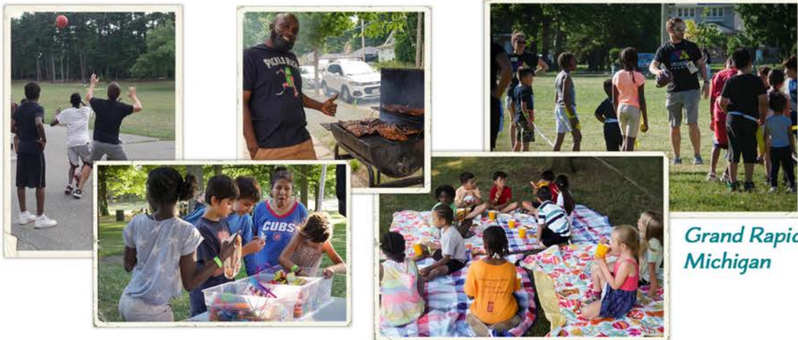
Grand Rapids, Michigan

Mosaic is a growing church with roughly 50-60 people and they have seen an incredible number of people coming to Christ in the last year. 18 people have made decisions to accept Jesus as their Savior. The church wants to live out Jesus' command to pray in Matthew 6:10 that God's kingdom come and His will is done here in Grand Rapids the way it is done in heaven.